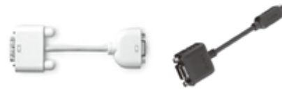
Samples of Connectors